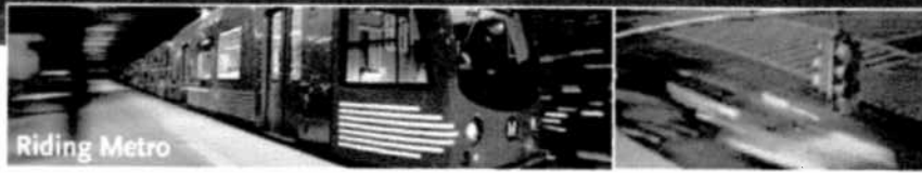
Photo Enforcement Services