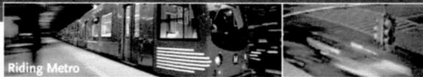
Photo Enforcement Services